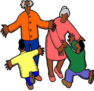
Court gives custody of two kids to the paternal grandparents.