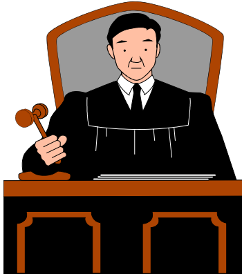
Trial court judge errs in sending boy's father from courtroom.

Even though his son never bore his last name, Dad was determined the child would never be known by his stepfather's surname.